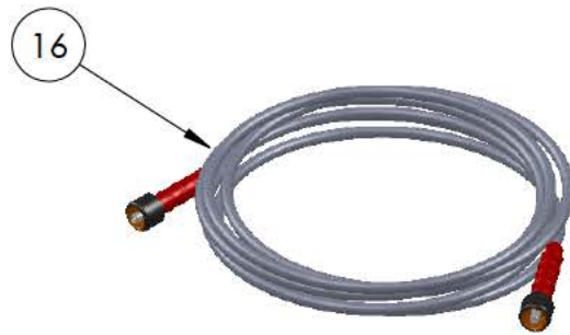
HOSE, 3400PSI 25FT PLATINUM M22-F x M22-F (PART NO. 7103726)