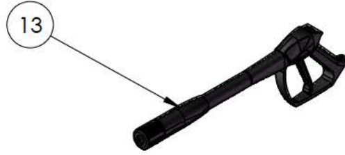
GUN 3500 PSI, 5GPM, M22-M INLET X M22 (PART NO. 7103569)