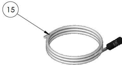
CHEMICAL HOSE AND FILTER KIT (PART NO. 7102207)