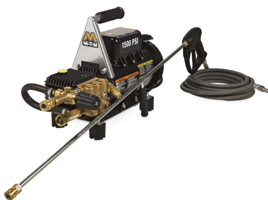
DC-1502-H0E1G (Hand Carry)

WARNING: Cancer and Reproductive Harm - www.P65Warnings.ca.gov .